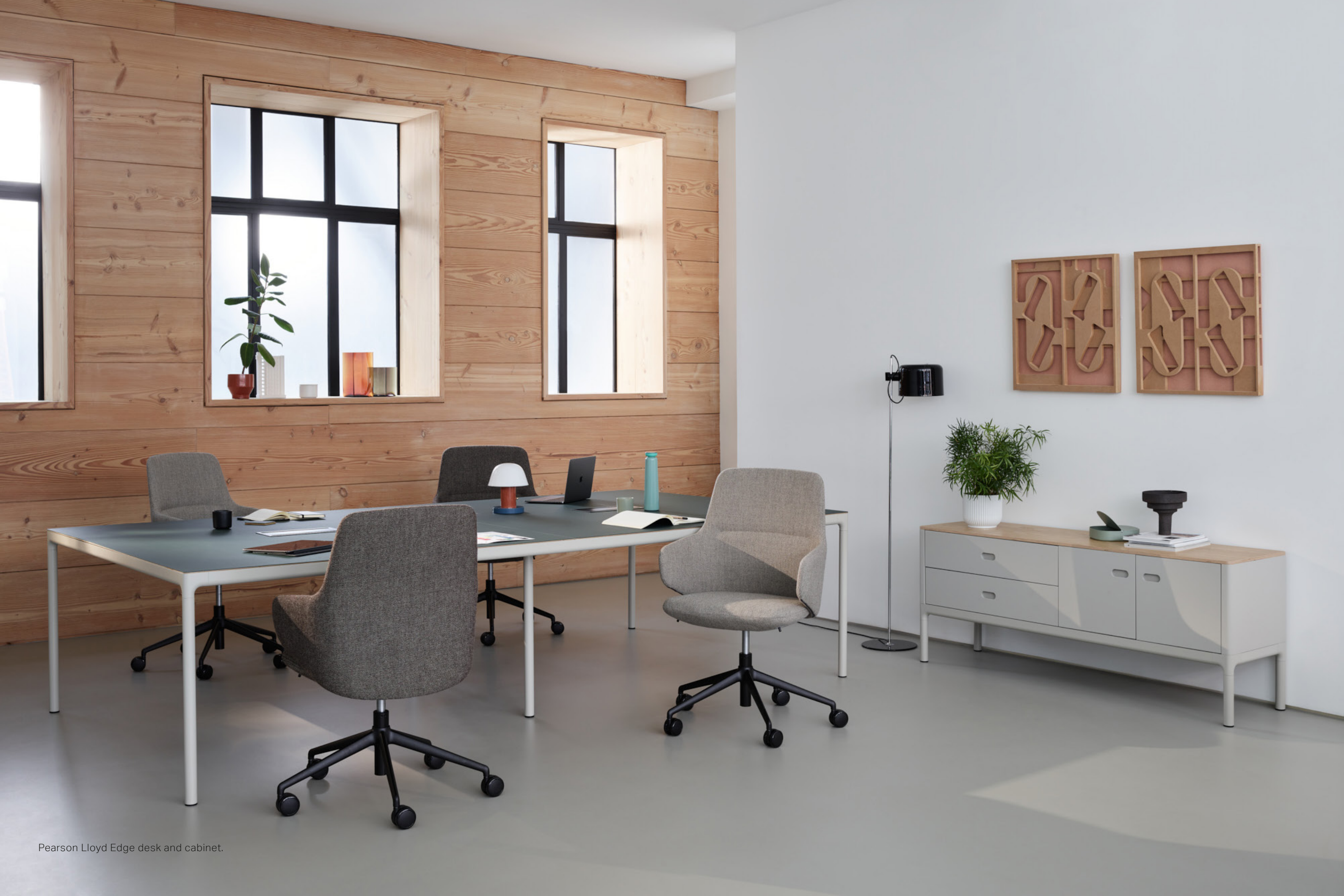
Pearson Lloyd Edge desk and cabinet.