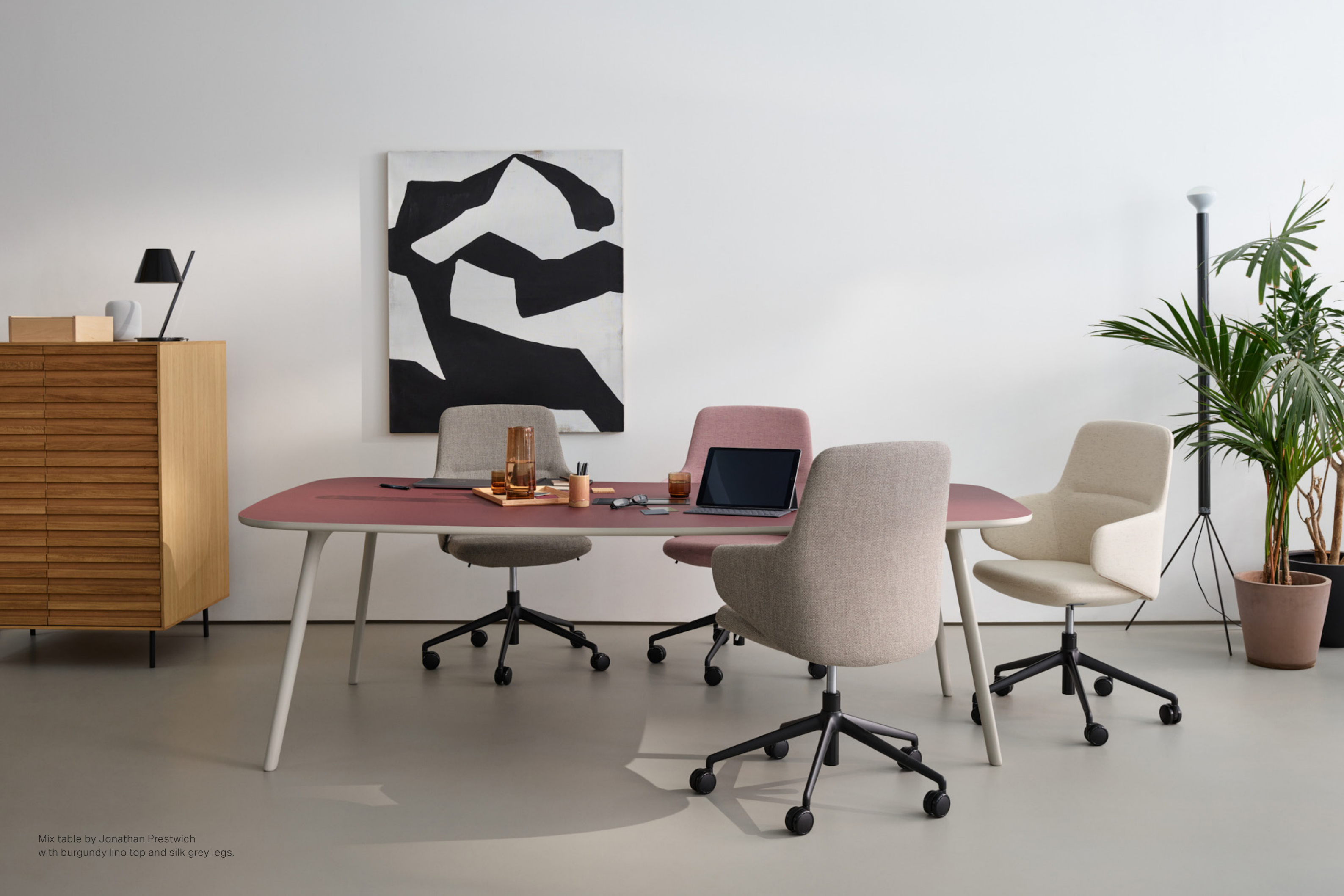
Mix table by Jonathan Prestwich with burgundy lino top and silk grey legs.