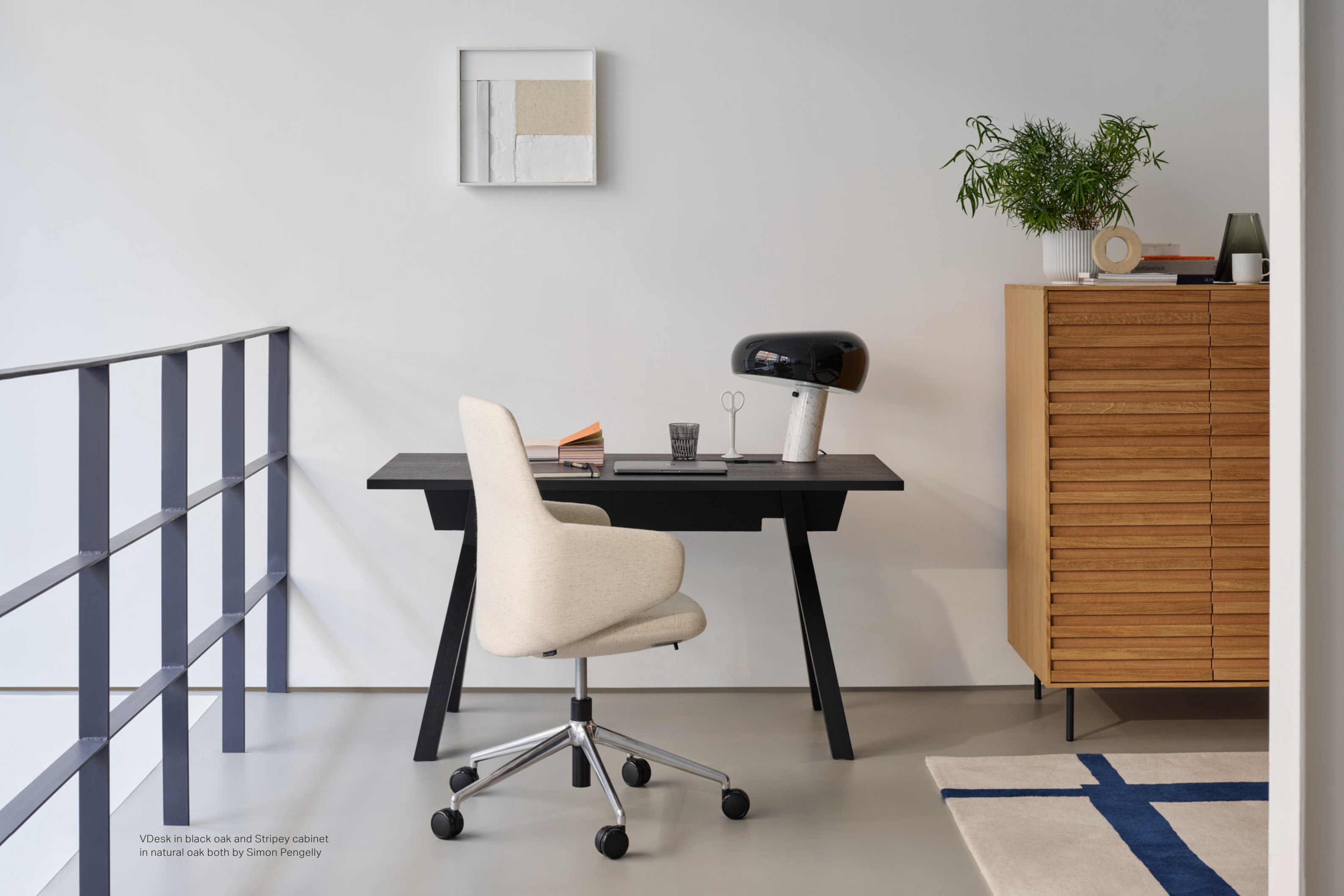
VDesk in black oak and Stripey cabinet in natural oak both by Simon Pengelly